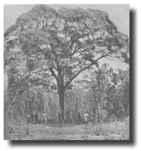
Aboriginal and non-Aboriginal people beneath Stuart's Tree carved with large 2 ft (61 cm) initials. Photo Paul Foelsche 1885.

In 1971 the Reserves Board of the NT placed a memorial cairn where the tree once stood, which is still in place today.